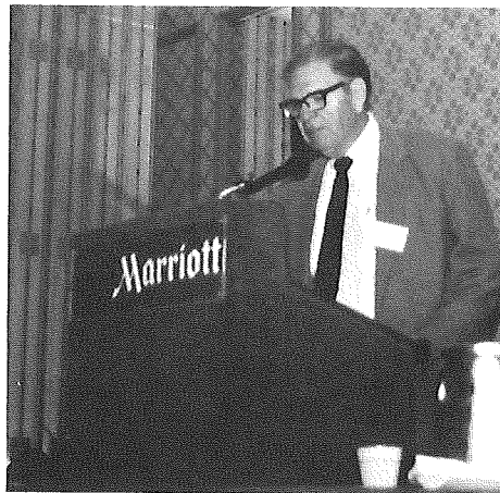
Honorable Peter S. Solito presides over the General Session on Thursday, September 25, 1986

Friday's meetings concluded a four-day conference attended by 887 judges and spouses from across the state. The educational portion of the conference covered various topics and satisfied 12 hours of continuing education for attending judges.